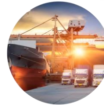
Transport and freight